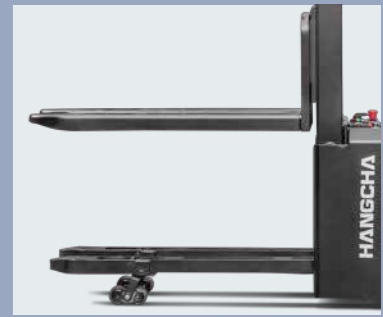
The pallet stacker with initial lift provides, higher efficiency and better passing ability