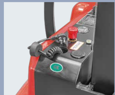
Built-in charger and maintenance free gel battery adopted to provide convenient usage