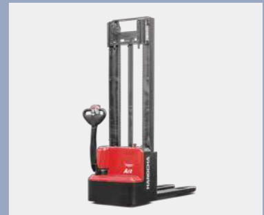
Optimized designing structure to offer a good visibility and easy entrance to the pallet