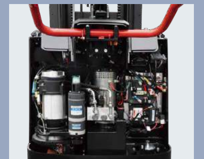
Back cover can be opened fully, and all components and parts are clear at a glance, which is very convenient for maintenance of the entire machine