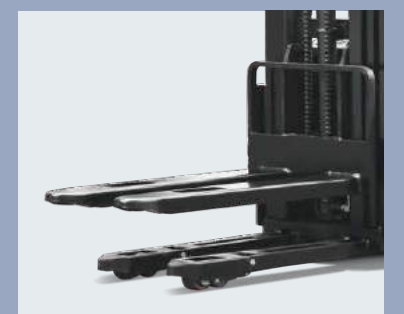
Tandem load wheel