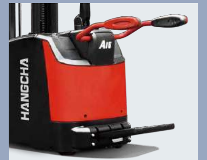
The integrated stamping molded guardrail offers better protection for the operator