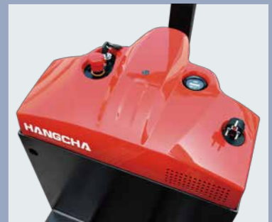
Modern outline design