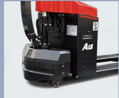
Auxiliary wheels are equipped to have better stability