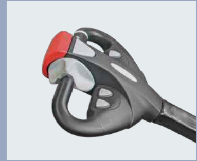
Rema tiller head